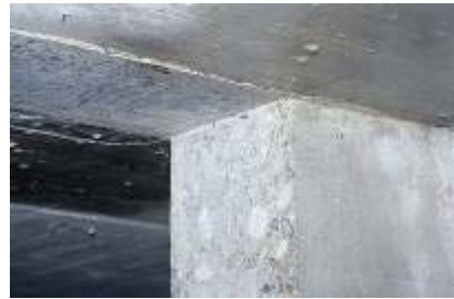
The finished product – a clean cut