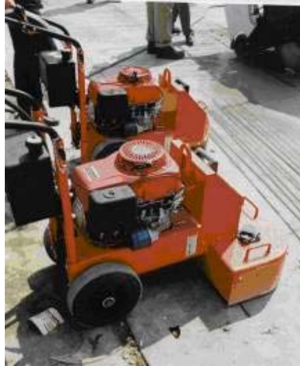
Floor Grinders can be used to quickly fix high spots on a variety surfaces.