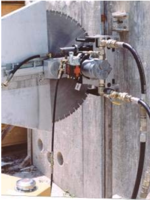
Wall saw preparing to make a cut