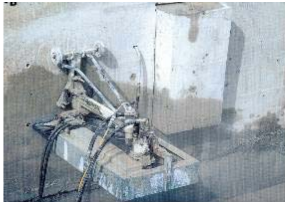
A wire saw could be used to create an opening in concrete instead of a wall saw.