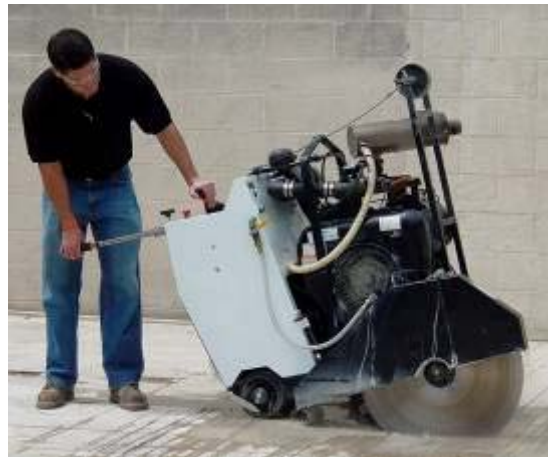
Flat saw making a cut.

A floor grinder could then be employed to remove any high spots or inconsistencies in the surface.