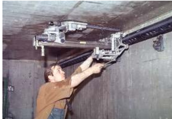
Corner cut chain saw preparing to finish the cut