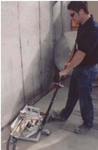
For making the flush cut along the floor, a flush cut hand saw on a cart could be used instead of a flush cut wall saw.